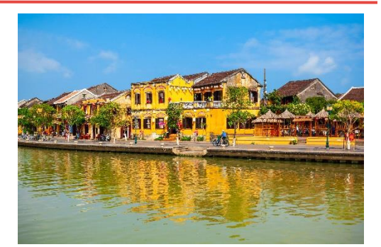
Meals: B, L, D